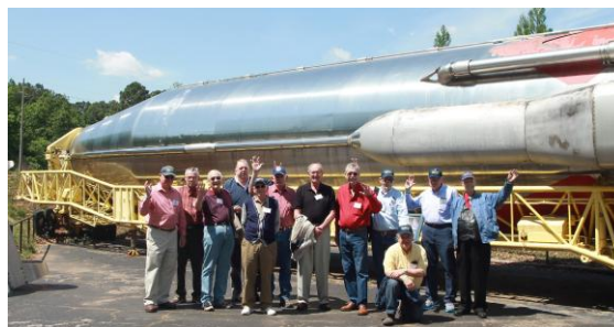
Look what we found in Huntsville !! and YES it is an Atlas-F !!